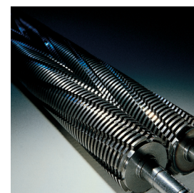
CUTTING KNIVES IN HARDENED STEEL unaffected by staples and metal clips