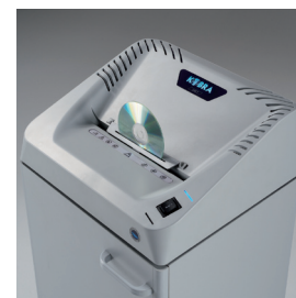
AUTO START & CD SHREDDING Automatic Start/Stop through electronic eyes. Integrated flap for CDs, DVDs, Floppy Disks and Credit Cards shredding