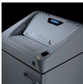
LED INDICATORS Easy to operate ON OFF Reverse switch, with LED signal for bag full or open door

SUPER POTENTIAL POWER UNIT heavy duty chain drive system with metal gears CONTINUOUS DUTY 24 hours continuous duty operation without overheating and duty cycles CUTTING KNIVES carbon hardened steel cutting knives unaffected by staples and clips ENERGY SMART® power saving stand-by mode just after 8 seconds of non-operation START & STOP automatic start and stop through electronic eyes with stand-by function SAFETY STOP automatic stop with light signal for bag full and / or open door AUTOMATIC REVERSE system in case of jamming CABINET attractive 110 litre cabinet mounted on casters