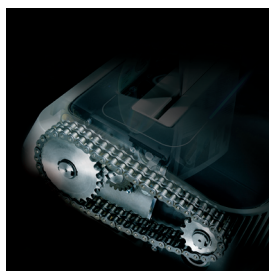
CHAIN heavy duty chain drive system and metal gears