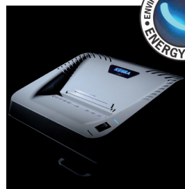
ENERGY SMART® management system with illuminated indicators for power saving in stand-by mode